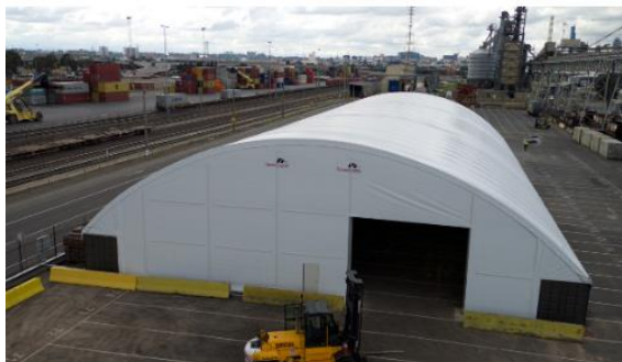
AAT build Dome Shelter provide 1800 mtrs of undercover storage at Appleton Dock