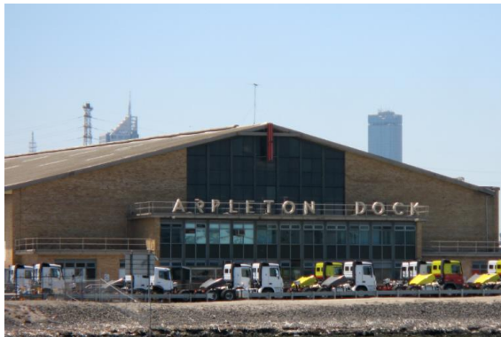
Appleton Dock – Pre Development

Since taking of the operating lease in April 2014, AAT has continually developed the Appleton Dock terminal supporting the diverse trade services through the terminal. In late 2017, AAT renewed its tenure at Appleton Dock for a further 5 years, commencing January 1, 2018. AAT Appleton Dock is now the prime general cargo terminal in the Port of Melbourne providing a range of services to shipping lines, stevedores and other terminal users. AAT will announce further site development in 2018.