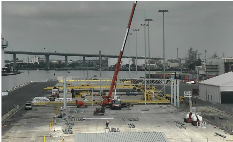
Progress image of construction from February, 2018. Construction is expected to be complete in June 2018